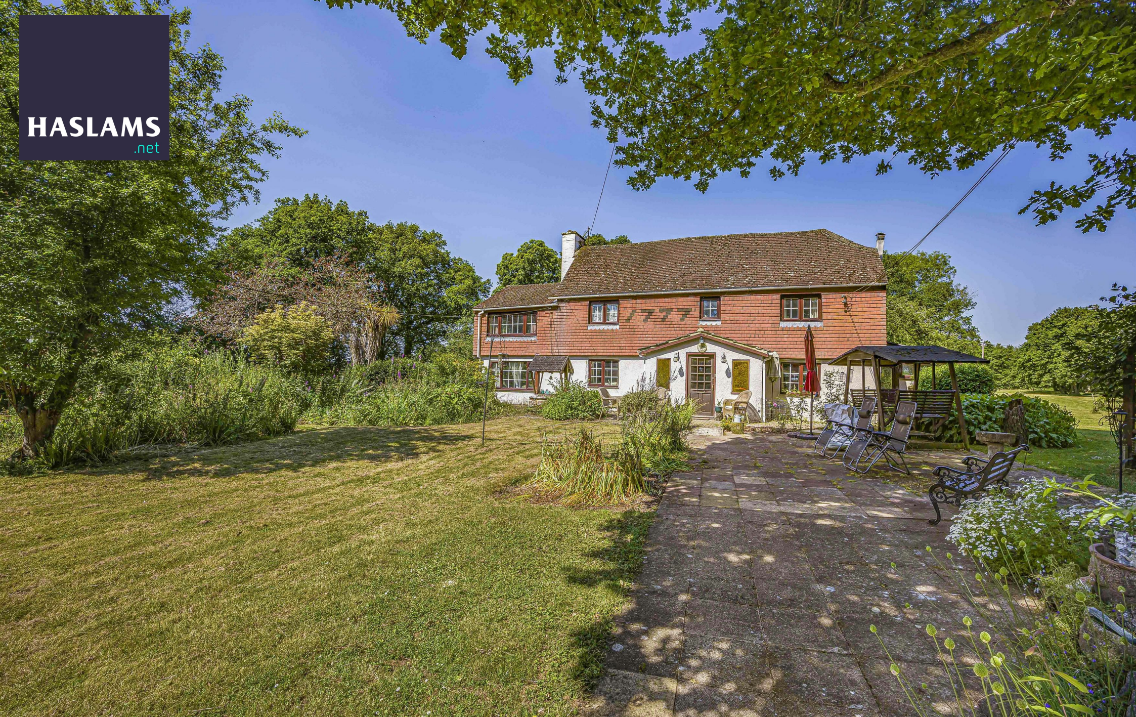
Bishopswood Cottage, Bishopswood Lane, Tadley, RG26 4AT